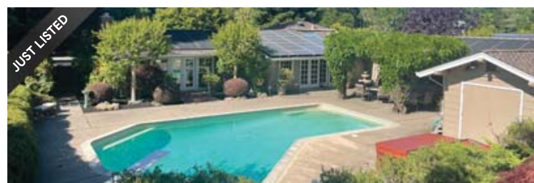
3983 Rancho Road Upper Happy Valley, Lafayette Offered at $2,795,000