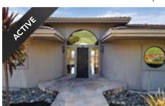
18 Northridge Lane Northridge, Lafayette

Offered at $2,195,000 | 1st year of HOAs FREE